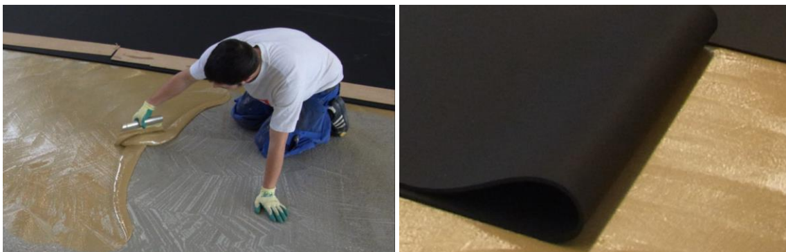
Adhesive applying onto clean substrate; roll out into the adhesive bed

Apply the glue evenly with a notched trowel over the area where KOMFORTEX® Floor Protection will be rolled out. Use a notched trowel with a notch depth as recommended by the adhesive manufacturer to achieve the correct spread rate. After the glue is spread out correctly, roll the material out into the adhesive bed (please take note of different adhesives curing time).