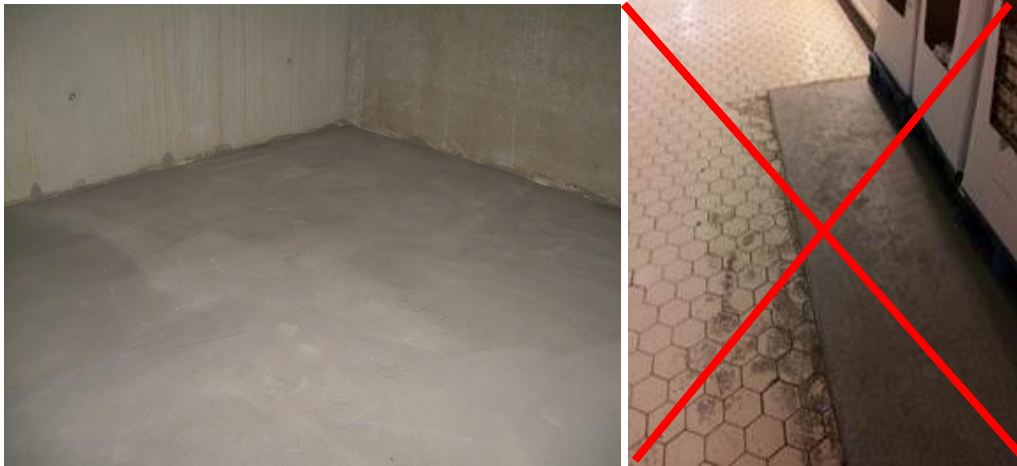
Even, suitable substrate made of poured screed uneven, not suitable substrate

All substrates made of asphalt, concrete and poured levelling screed are suitable for installation. The substrate must be solid, level, dry, clean and free of cracks, undulations and dust which can potentially affect adhesion.