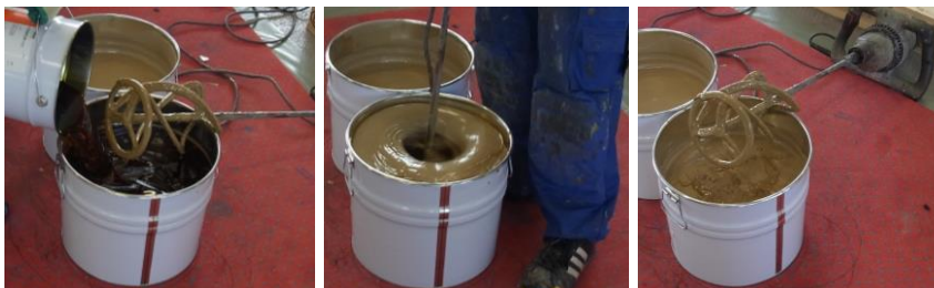
Mixing of the 2-component PU adhesive

The KOMFORTEX® Floor Protection covering material is delivered in rolls and must be stored on site for 1-2 days at a temperature between 15 °C and 25 °C before installation. On the day prior to installation roll out the material fully, but do not bond down, so that the rolls can relax.