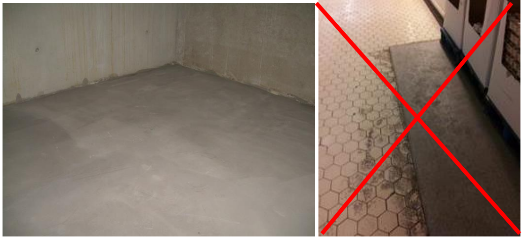
Even, suitable substrate made of poured screed uneven, not suitable substrate

All substrates made of asphalt, concrete and poured levelling screed are suitable for installation. The substrate must be solid, level, dry, clean and free of cracks, undulations and dust which can potentially affect adhesion.