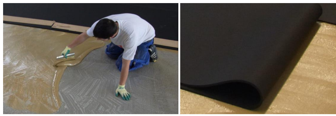
Adhesive applying onto clean substrate; roll out into the adhesive bed

into the adhesive bed (please take note of different adhesives curing time).