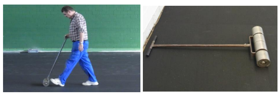
Scrolling of the floor with a pressure roller

After the adhesive has grabbed but before adhesive is fully cured, contact pressure should be applied to the surface with a roller to eliminate air bubbles underneath the material.